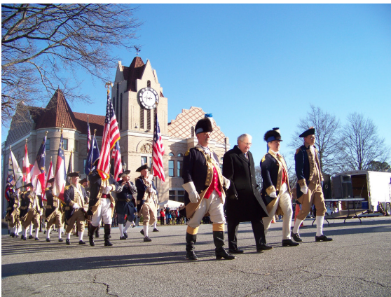
Leading the parade.