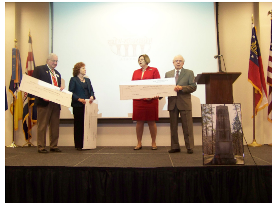
Recognition of Contributors

The Kettle Creek Battlefield Association held its annual meeting on Saturday night at the Pope Center. Various contributors to the association were recognized with larger than life checks.