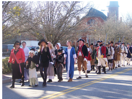
Georgia State Society Children of the American Revolution