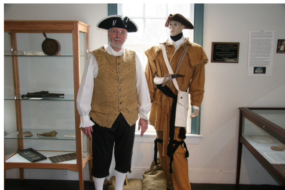
Washington Historical Museum Kettle Creek Battlefield Display