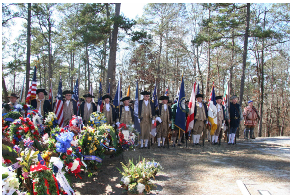
Georgia Society SAR Color Guard