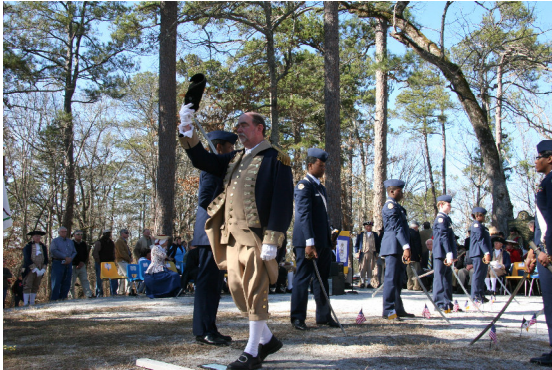
"Patriots, we salute you"