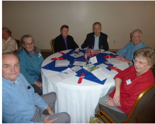
Table decoration were prepared by the Kettle Creek DAR Chapter. I'm ready to eat!