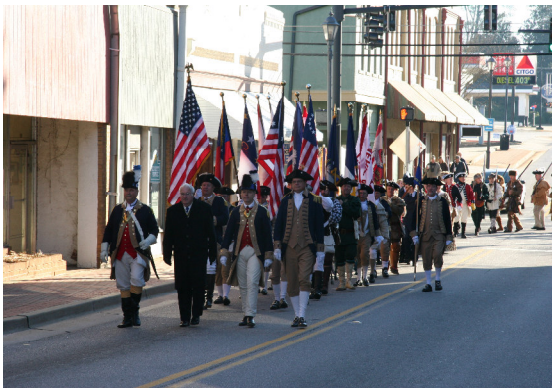
Georgia Society SAR Color Guard

Saturday's activities began with the award winning Georgia Society SAR Color Guard leading the parade from the Mary Willis Library and proceeding to the Washington Town Square. Participants consisted of patriots of the Continental Army, Georgia Militia, ROTC Cadets and local youth groups. Individuals portrayed George Washington, Benjamin Franklin, Elijah Clarke, Nancy Hart, Continental Army soldiers, a backwoods trapper, spinner, weaver and others. Local children marched enthusiastically as part of the parade.