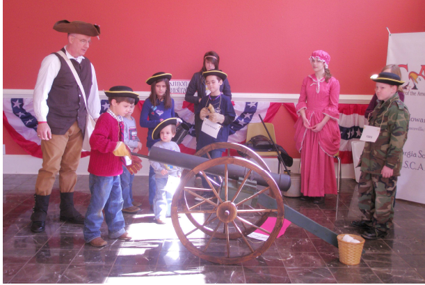
Learning to fire a cannon.