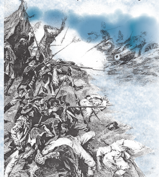
Attack on Spring Hill Redoubt, October 9, 1779

The Franco-American troops attacked with "spirit and patient bravery," and the British defended with "confidence and courage."