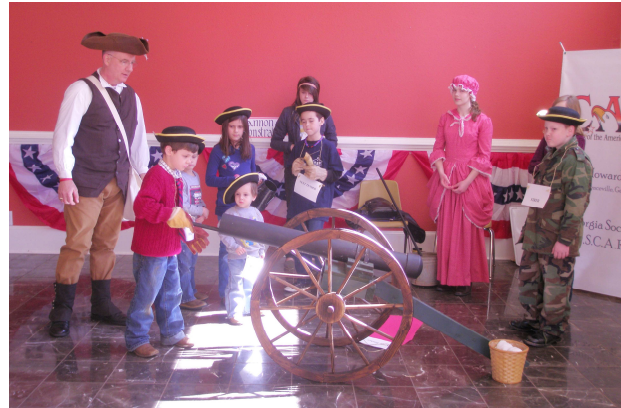
Learning to fire a cannon.