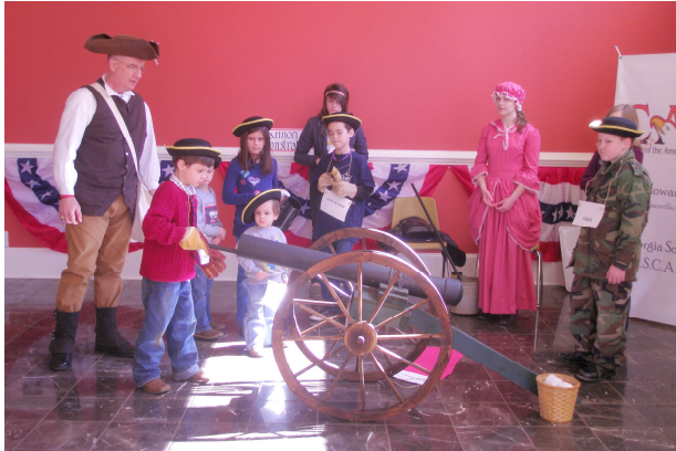
Learning to fire a cannon.